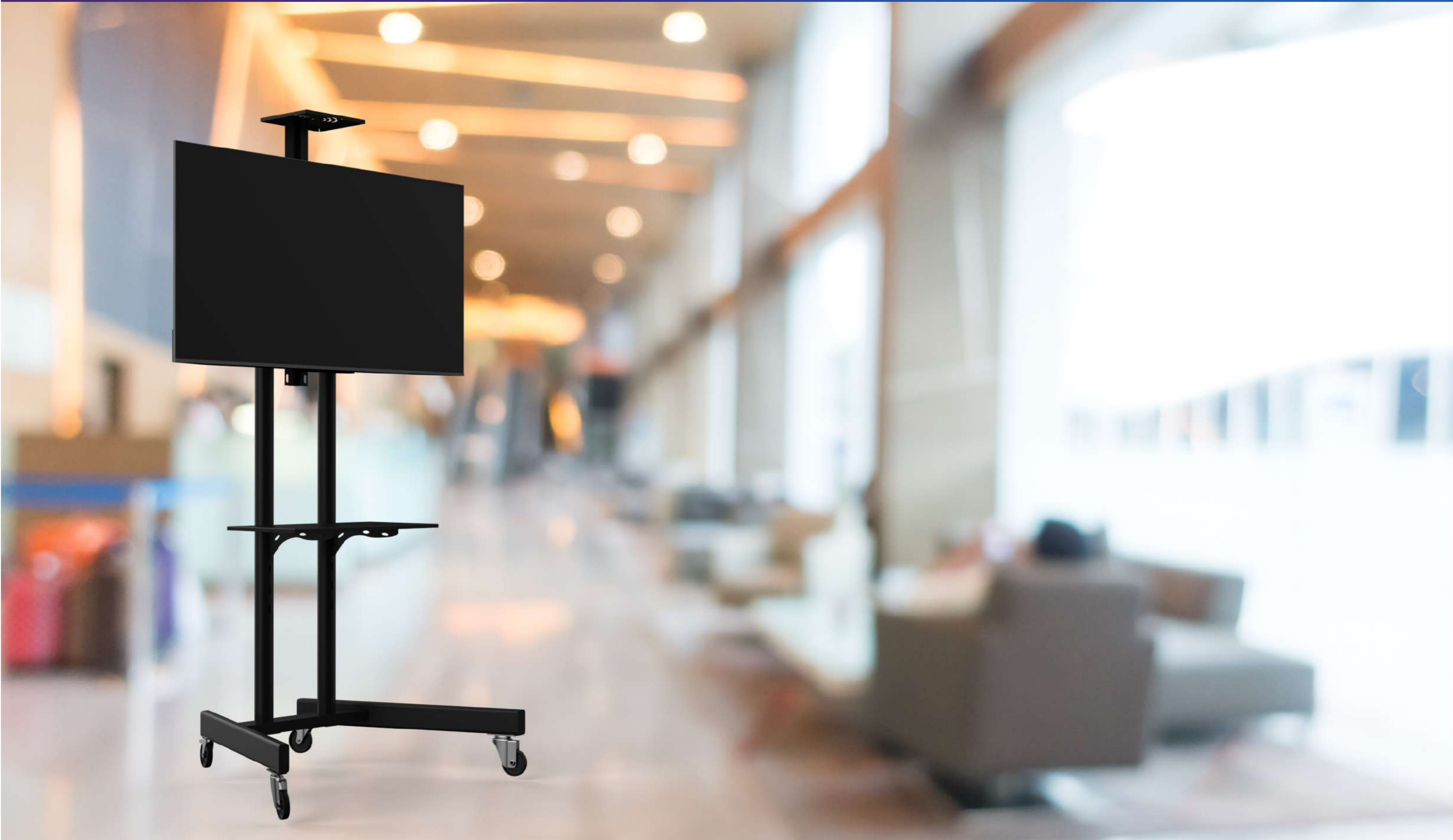
TV & Video Conferance Stand