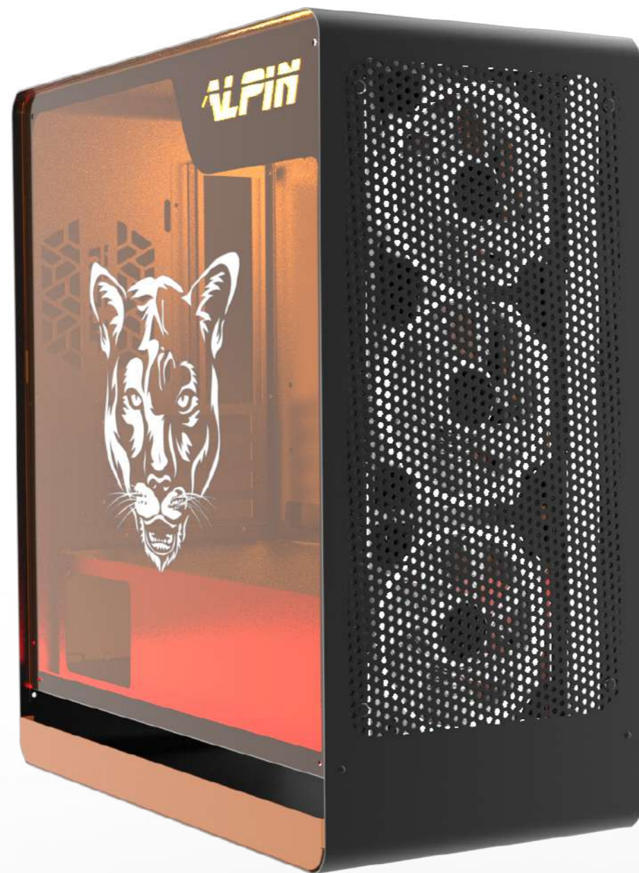
Gaming Computer Case